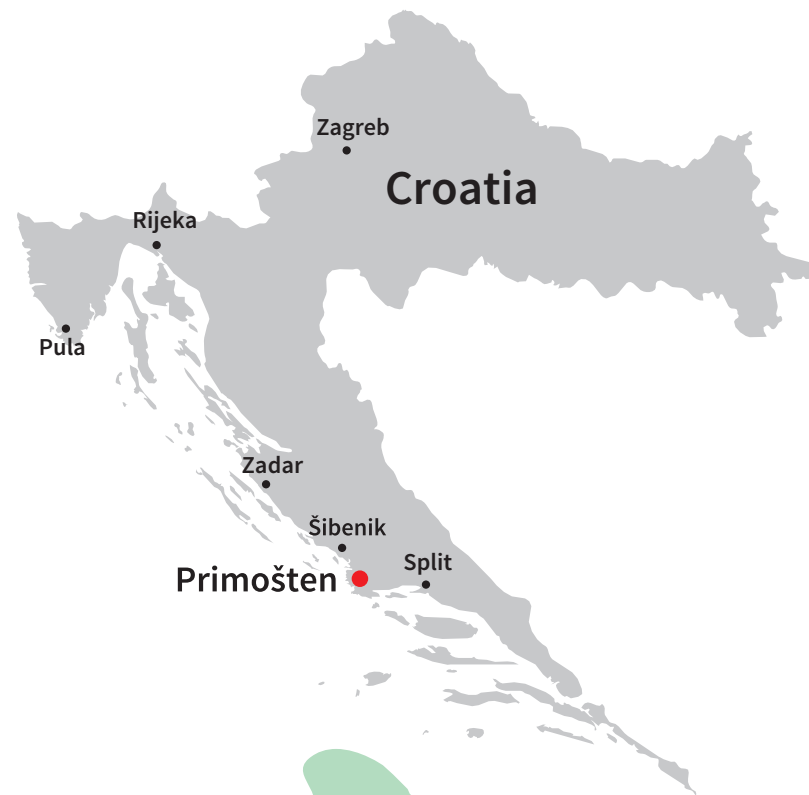
UDALJENOST OD EUROPSKIH GRADOVA DISTANCES FROM EUROPEAN CITIES